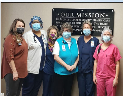
Nursing Education Department at Nash UNC Health Care